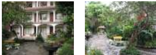
Night Accommodations at a local hostel in Baños

Day 3 - Flight from Shell airfield to Lorocachi airfield, about 300 miles deep into the rural jungle of the Amazon basin. Meet with Eco-Planet's indigenous jungle crew members who will escort us along the expedition. Dugout canoe ride along the Curaray River will take us to Victoria's Jungle community - An authentic Amazon village that hosts Eco-Planet Adventures.