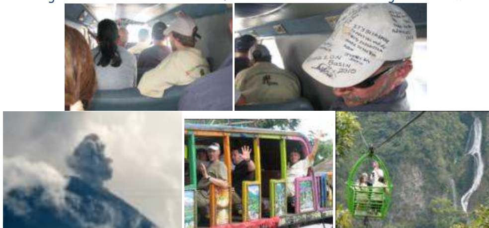
Night Accommodations at a local hostel in Baños

Day 11 – Embarking the jungle by a plane back to Shell. Eco-Planet Adventure will continue up the Andes back to Baños - a colorful town that sits at the foothill cliff of Volcano Tungurahua. Baños de Agua Santa is refuge for more than 60 waterfalls that offers the most tranquility time so needed for body recovering following jungle expedition... The town also offers party and joy. Baños has an entertainment district with bars, discos, karaoke and other entertainment centers, which offer tourists the warmth of the local people. It is a safe place to enjoy all kinds of music and the best cocktails. Don't miss the nightly party bus trip to the observation mountain over the Tungurahua Volcano and the local fire ritual conducted each night on the mountain top.